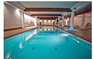
Pool and hot tub at Enzian Inn