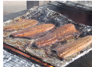
Kiwanis Salmon Barbeque