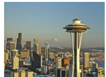
Seattle Space Needle