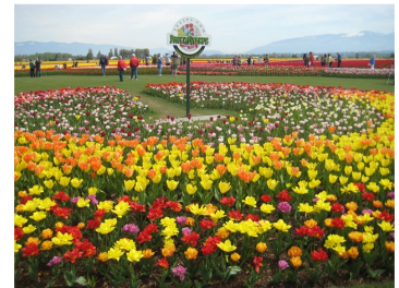
Display gardens at RoozenGaarde Tulip farm