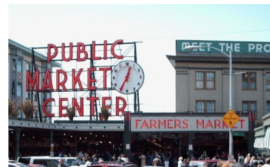
Pike's Market - Seattle